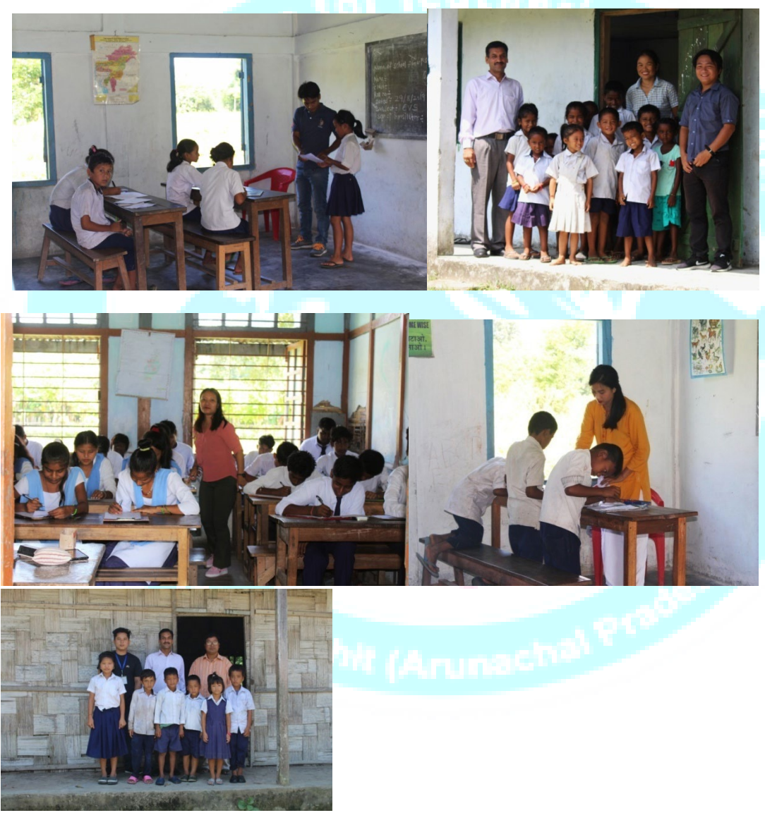
Internal Assessment Test

After acquiring the knowledge about Micro-Teaching Skills, 3<sup>rd</sup> semester student-teachers was allotted government as well as private schools for practicing teaching for 20 days as per the permission of DDSE Lohit district on dated 19<sup>th</sup> August 2019. Student teachers prepared and delivered 20 lesson plans in each opted pedagogy subject. Therefore each trainee delivered 40 lesson plans during the period of practice teaching.